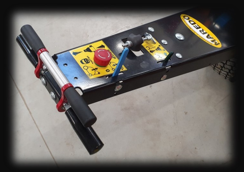
Easy accessible controls