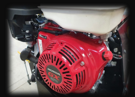
STrac 700-26: 8.5 HP HONDA engine STrac 720-26: 12,5 HP HONDA engine